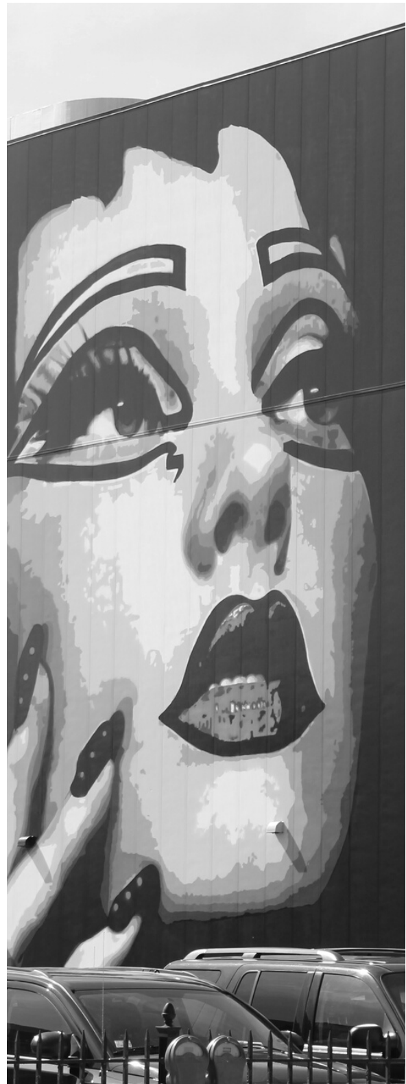
POW WOW Mural in Worcester funded with the Placemaking mini grants in 2013

We also convened a regular working group of agencies that helped lead to major new placemaking initiatives at MAPC, MassDevelopment, and A Better City. MSGA hosted a Placemaking Leadership Council meeting in 2016 with foundations and implementation partners that built funder interest in these projects.