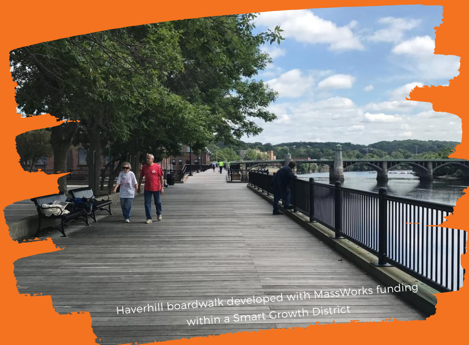
Haverhill boardwalk developed with MassWorks funding within a Smart Growth District

We supported the prioritization of multifamily housing projects in MassWorks applications. More recently, we have been supporting measures in the Governor's proposed economic development package that include: affordable housing near transit nodes, climate resilient affordable housing, and neighborhood stabilization.