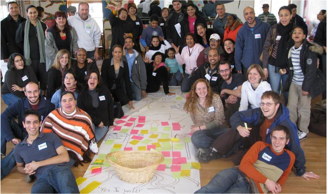
Community Planning in Lawrence

MSGA launched Great Neighborhoods in 2010 to support local partnerships in implementing their transformative visions. Five compelling initiatives were selected to participate based on their readiness: the Fairmount corridor in Boston, Dudley Square in Roxbury, downtown Lawrence, the Green Line extension in Somerville, and Winchester Town Center. Each site presented unique challenges and lessons about transit-oriented development in Greater Boston.